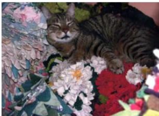
Heather's original photo of Timmy in the lap of luxury.

The Timmy in the rug looks younger, more of a kitten, so perhaps Heather is simply trying to justify and excuse allowing a cat such luxury by depicting him as a naughty kitten.